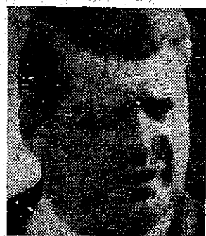
John Le Mesurier